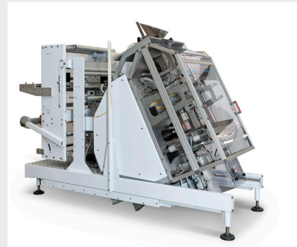
A Wide Variety of Package Styles, Including Recloseable Options