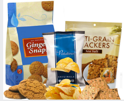
Ideal for Fragile Products Including Bakery, Crackers and IQF