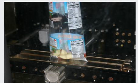
Continuous Motion Reciprocating Jaws for the Strongest Seals

Hayssen Flexible Systems S.r.l Via Trieste, 53 | Mestrino (PD) | 35035 ITALY t. +39 049 9006511