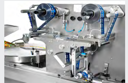
Automatic Film Splicing (optional)