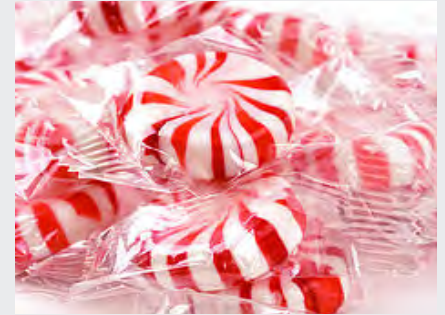
Ideal for Hard and Soft Candies