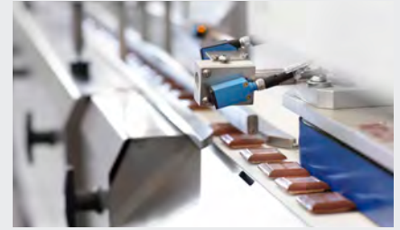
Automatic Feeder (option)