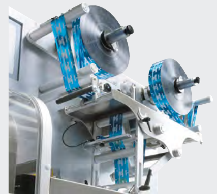
Automatic Film Splicing (option)