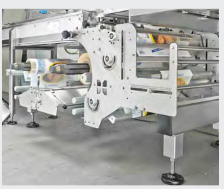
Bottom Film Feed