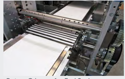
Rotary Crimper for End Seals