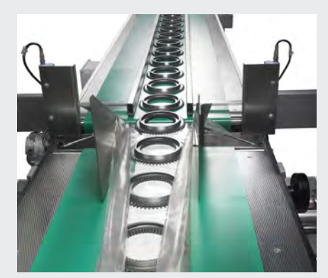
Heavy-duty lower carrying belts