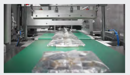
Guillotine-type or box-motion cross sealing system