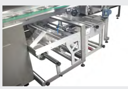
Bottom film feeding