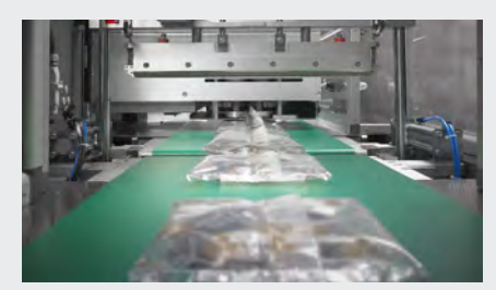
Guillotine-type or box-motion cross sealing system