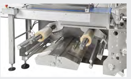
Automatic Reel-to-Reel Splice Option