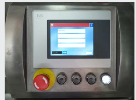
5.7" Color Touch Screen with Icon-Based Screens