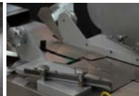
Adjustable folding box