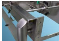
Quick-release infeed catch tray