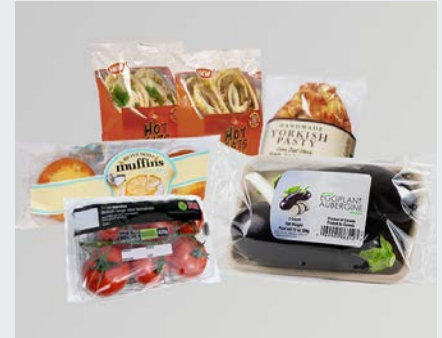
Variety of Package Style Configurations

A few of the many available options include twin jaws configuration, reel runout sensor, misplaced product detect, product high sensor, pin type perforator, infeed extensions, gusseting units, crimp carry over unit, euroslot crimp jaws, labellers