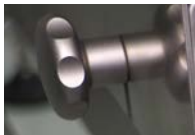
Tool-less removal of guarding