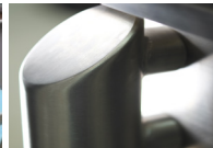
Sloped surfaces, rounded legs