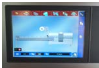
Intuitive icon-based interface