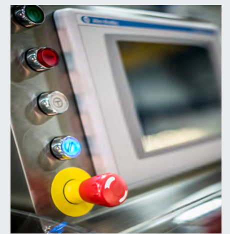
Icon-Based Operator Interface with Intuitive Set Up Features