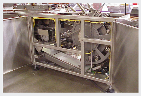
Open Access Front and Rear Frame