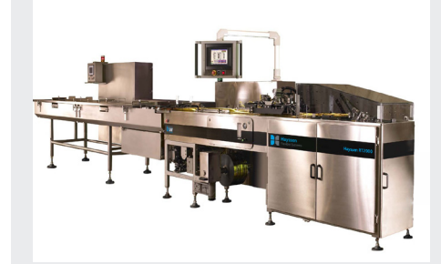
Infeeds offered for a fully integrated packaging solution