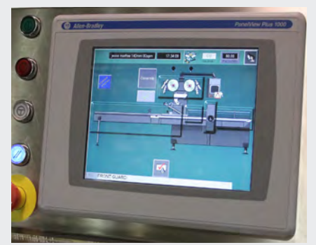
Icon-based operator interface with intuitive set-up features